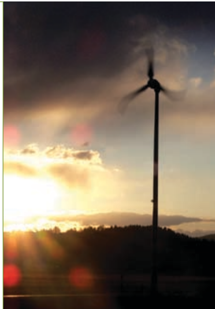
DON JOSLIN, ARCHITECTURAL & ENVIRONMENTAL ASSOCIATES, INC.

The single resident of the house is comfortable and is happy with all the water and energy saving low-flow fixtures in the house. Two types of low-flush toilets were installed, one by Coroma and one by Kohler; although they both work, the Coroma has worked better than the Kohler. The rainwater catchment was designed to support a