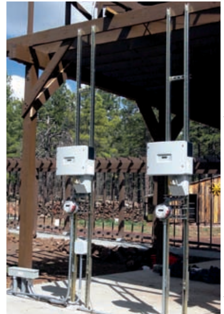
Two grid-tied SMA Sunny Boy inverters are powered by the PV system and supply electricity for the home.

The renewable electricity systems were sited away from the house. This made it possible to position the house to take advantage of passive-solar orientation, shade resources, and a natural windbreak to the north, without