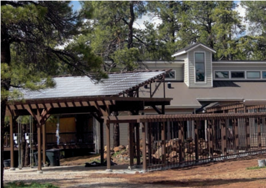
The PV system also serves as the roof for the carport. This idea was awarded LEED points for using the PV to shade a man-made hard surface. A grape arbor connects the carport to the entrance of the home.